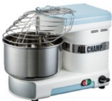
Ice cream (A918-W)