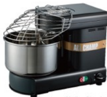
Stellar Black (A918-B)