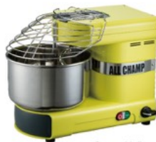
Sunny Yellow (A918-Y)