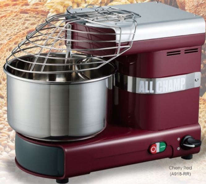
Cherry Red (A918-RR)