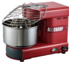
Rose Red (A918-R)